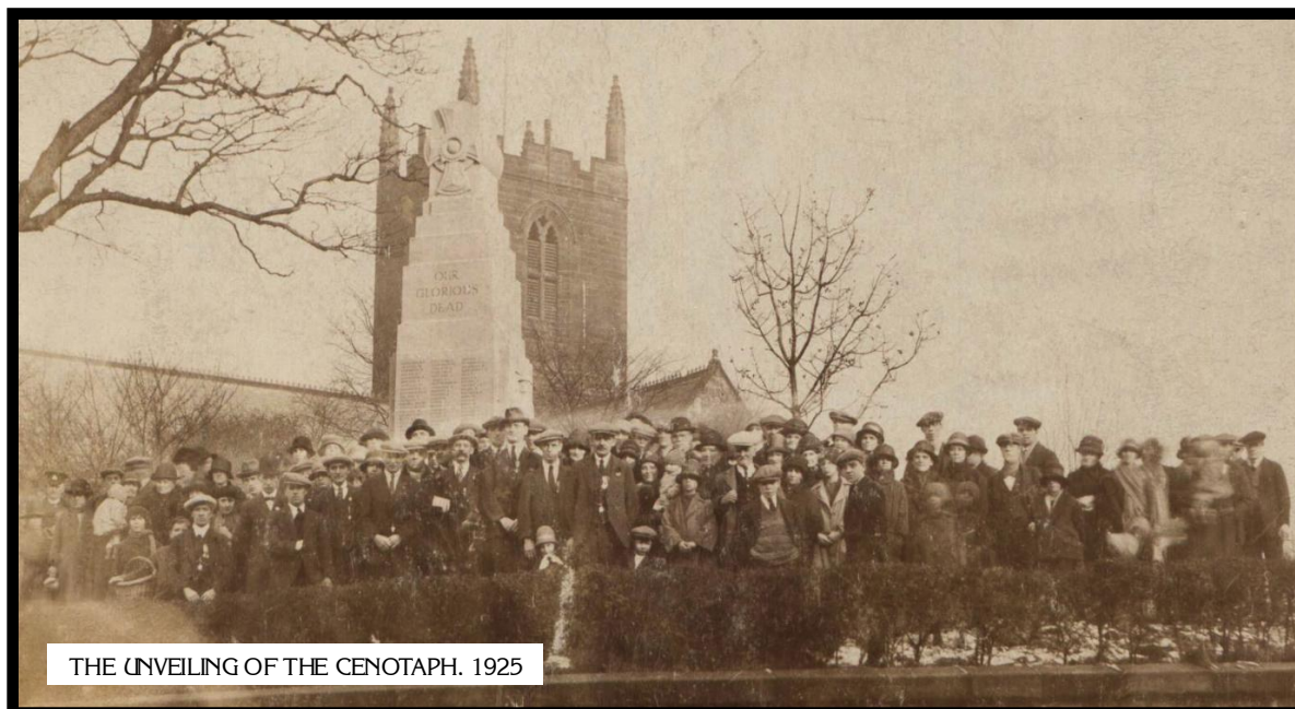
THE UNVEILING OF THE CENOTAPH. 1925

ON REMEMBRANCE SUNDAY, Houghton-le-Spring fell silent as we remembered the War Dead in our homes, in the local churches, throughout the community and at the Cenotaph in the town centre. The Cenotaph was unveiled on November 7 th 1925 in the southwest corner of the churchyard. Made of Portland stone at a cost of £7,000, the memorial was erected in memory of those who died during the Great War of 1914 – 1919. Funds were raised by public subscription and even the Scouts lent a hand in fundraising at a carnival on Houghton Racecourse.