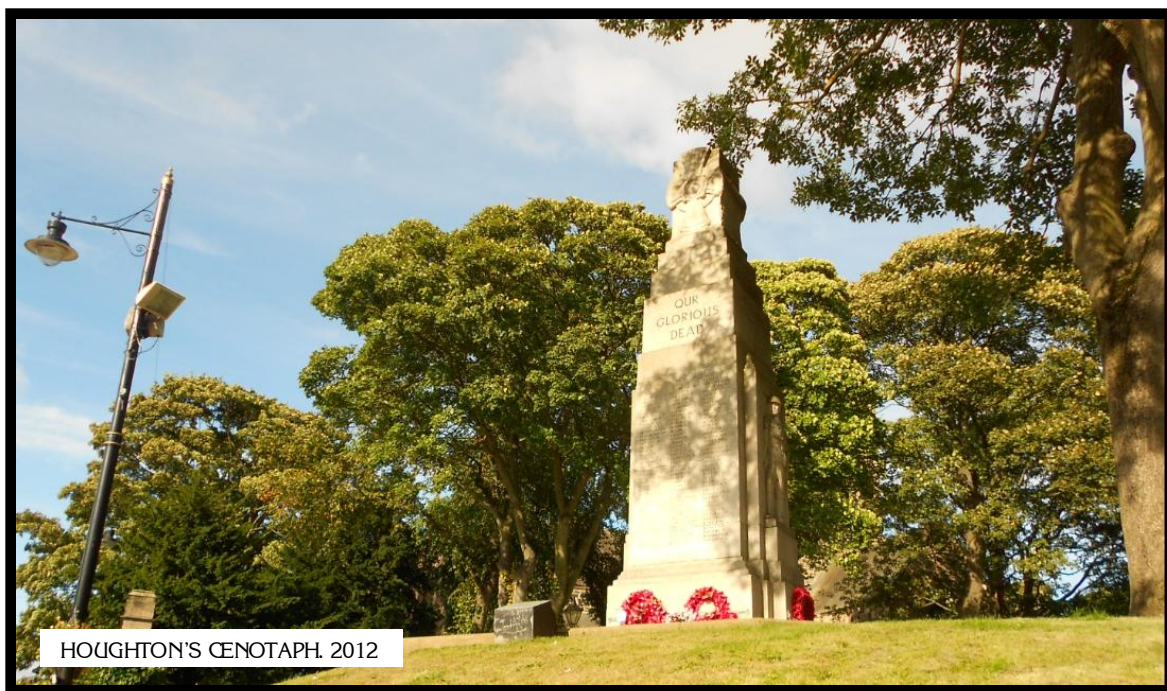
HOUGHTON'S CENOTAPH. 2012